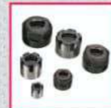
ER Collets NUTS UM A