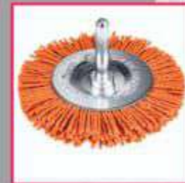
Nylon Wheel Brush