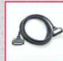
DSP Cable A11