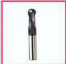
Carbide Ball Nose Tool