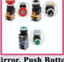
Mirror, Push Button, Emergency Switch