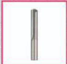
Carbide Straight Flute Cutter