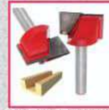
Surface Remover [25mm, 30mm]