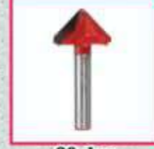
90 deg [10mm to 22mm]