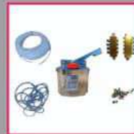
Oil Pump Manual