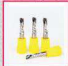
Aluminium Sheet Cutter