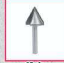
60 deg [17mm, 22mm]