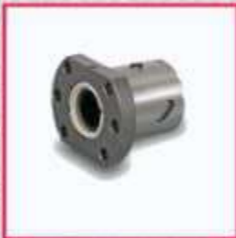
Linear Ball Nut