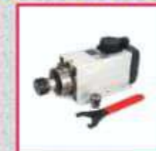
Air Cooled Spindle