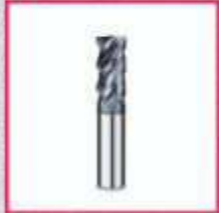
4 Flute Carbide Endmill