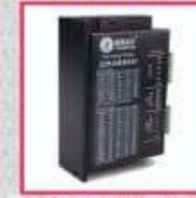
Lead Shine Drives