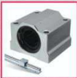
Linear Round Block