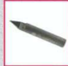
Marble Engraving Tool