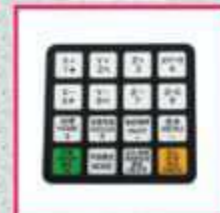
DSP Key Pad Stickers