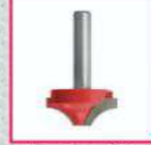
Beading Bits [22mm, 25mm, 32m]