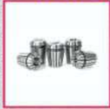
ER Collets[ER20, 25, 32]