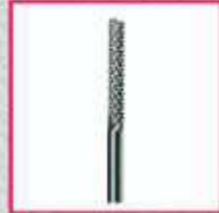
Cement Sheet Cutting Tool