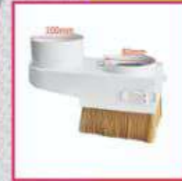
Dust Collector Inlet