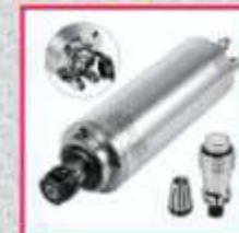
Water Cooled Spindle