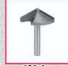
120 deg [32mm, 140 deg]