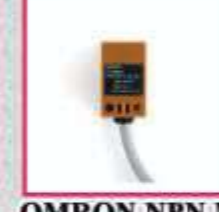
OMRON NPN NO