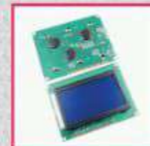
LCD Screen for DSP