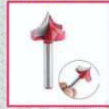
Ovolo Sharp Tip [10mm to 32m]