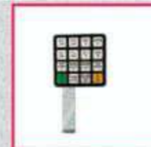
DSP Key Pad with Board