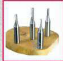
ACP Cutting Tool