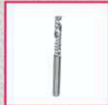
Single Flute Spiral Bit