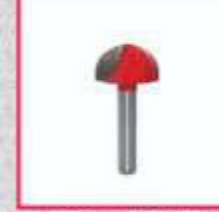
Round Ball [10mm, 32mm]