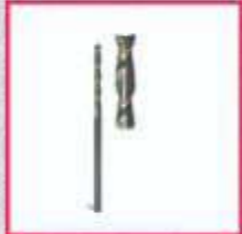
2 Flute Carbide Endmill