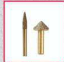
Stone Engraving Tool