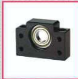
Ball Screw Support