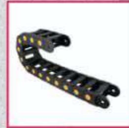
Cable Drag Chain