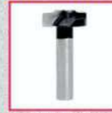
MB Tools [25mm, 32mm]