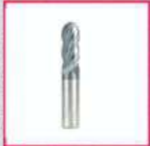
4 Flute Ballnose Tool