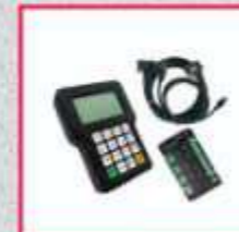
DSP Controller A11