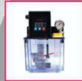
Automatic Oil Pump