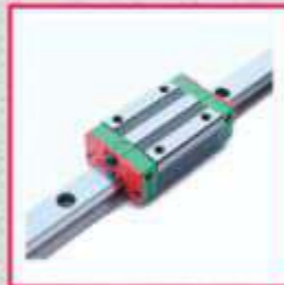
Linear Bearing Block