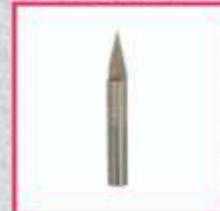
Keethu Bit Tool